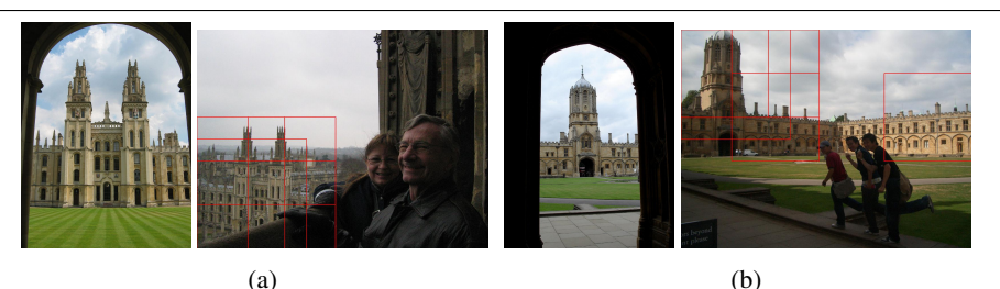
Figure 1: This figure shows two challenging examples with backgrounds and clutters in Oxford5k. In each example, the left is a query, while the right is its corresponding positive image. We mark top five attentive regions of our regional attention network in the positive images as red boxes.

To avoid newly fine-tuning the network depending on target categories of images, we encode images into compact feature vectors using an off-the-shelf CNN, commonly known as a general feature extractor. In this context, we set a target type of this work to the "pre-trained single-pass" category of CNN-based approaches, defined by Zheng et al. [1] for efficient and accurate image retrieval.