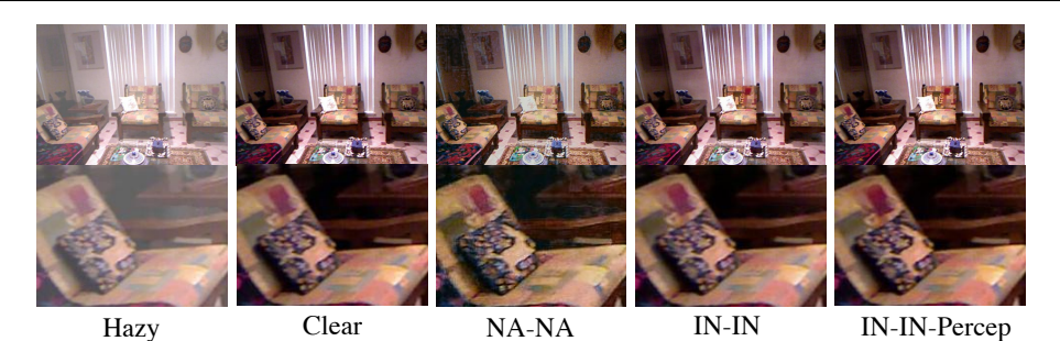
Figure 2: An example of qualitative results in ablation study. We zoom in the bottom left corner of the images to show more details in the second row.