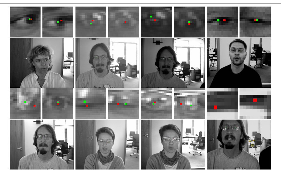
Figure 3: Snapshots of the failed localization results. For the BioID dataset, the localization result considered to be failed if the normalized error is bigger than 0.05.

of the iris were proposed to improve the localization accuracy. The convolution operation greatly reduces the computational cost and enables the algorithm to be integrated into real-time applications. The high accuracy and low combinational cost property make HAC an ideal solution for eye center localization in the common human-machine interaction scenario. HAC was shown to achieve a large performance improvement on two most commonly used eye center localization datasets, covering both low-resolution conditions and high-resolution lab environments. Future direction will focus on exploring its performance in more practical human-robot interaction scenarios.