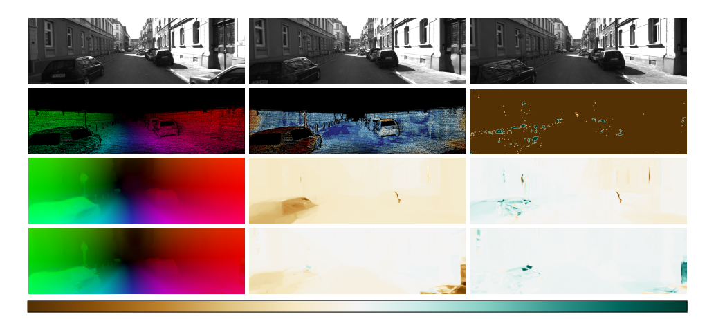
Figure 1: Exemplary result for a sequence of the KITTI 2012 [ D ] benchmark. First row: Input frames f^{t-1} , f^t and f^{t+1} . Second row: Ground truth forward flow, bad pixel visualization and computed order selection map o (first-order: turquoise, second-order: brown). Third row: Computed forward flow \mathbf{w}^t , coefficients c_1^t and c_2^t (shifted and rescaled, zero maps to white). Fourth row: Computed backward flow \mathbf{w}^{t-1} , coefficients c_1^{t-1} and c_2^{t-1} .

Table 2: Results of the MPI Sintel [I] benchmark test sets. Top 10 non-anonymous methods and methods related to our approach.